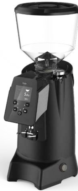
PULSE 65 & 75